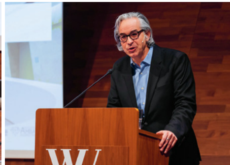
Jesús Crespo Cuaresma