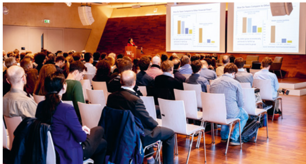
Annual Meeting of the Austrian Economic Association