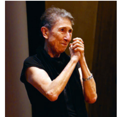
Silvia Federici

The event was organized by the Center for Students of Economics (VW-Zentrum) as part of their focus on feminist economics in winter term 2019/2020.